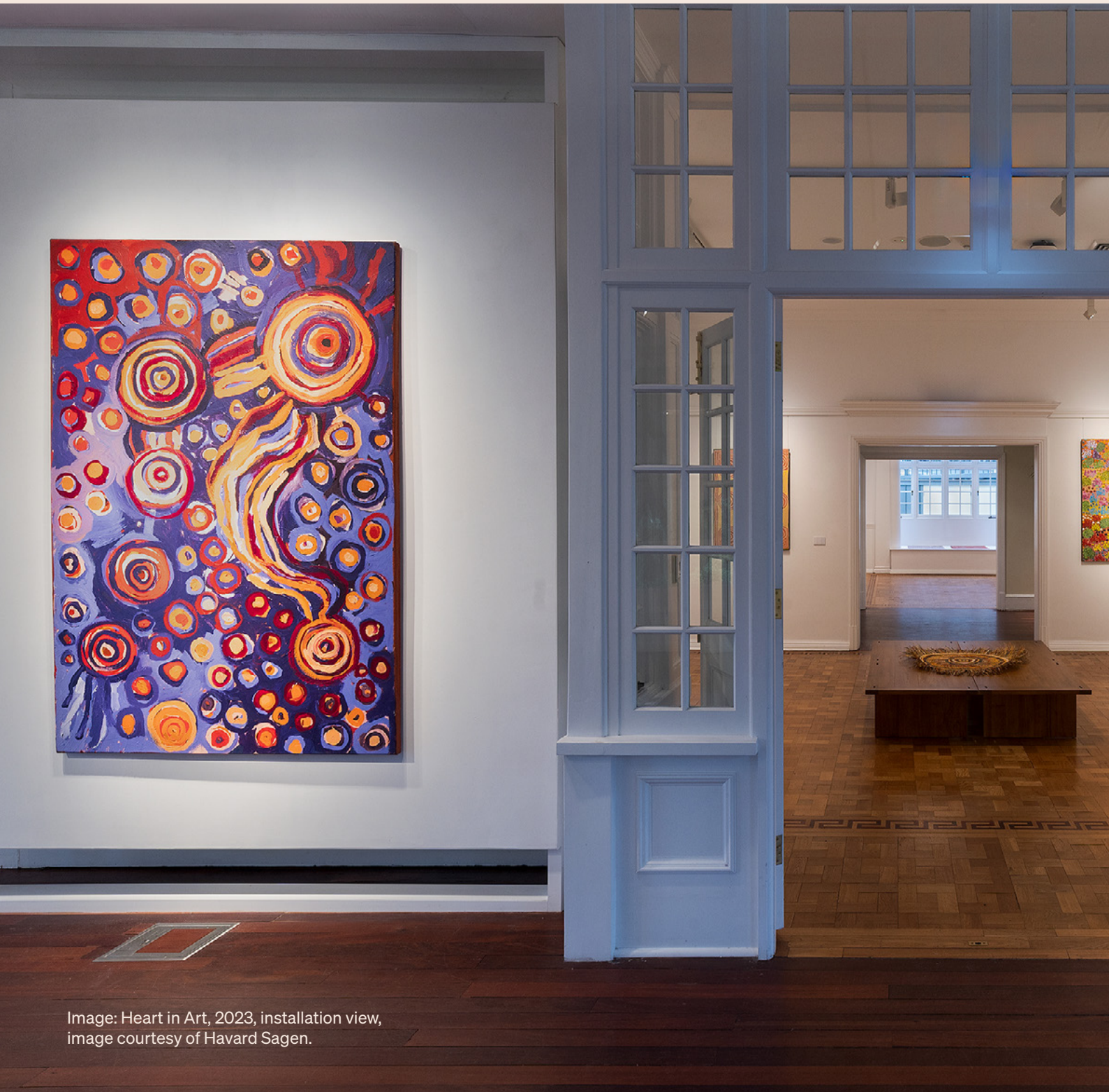
Image: Heart in Art, 2023, installation view, image courtesy of Havard Sagen.

Woollahra Gallery at Redleaf welcomes exhibition proposals through our annual Expression of Interest (EOI) Program.