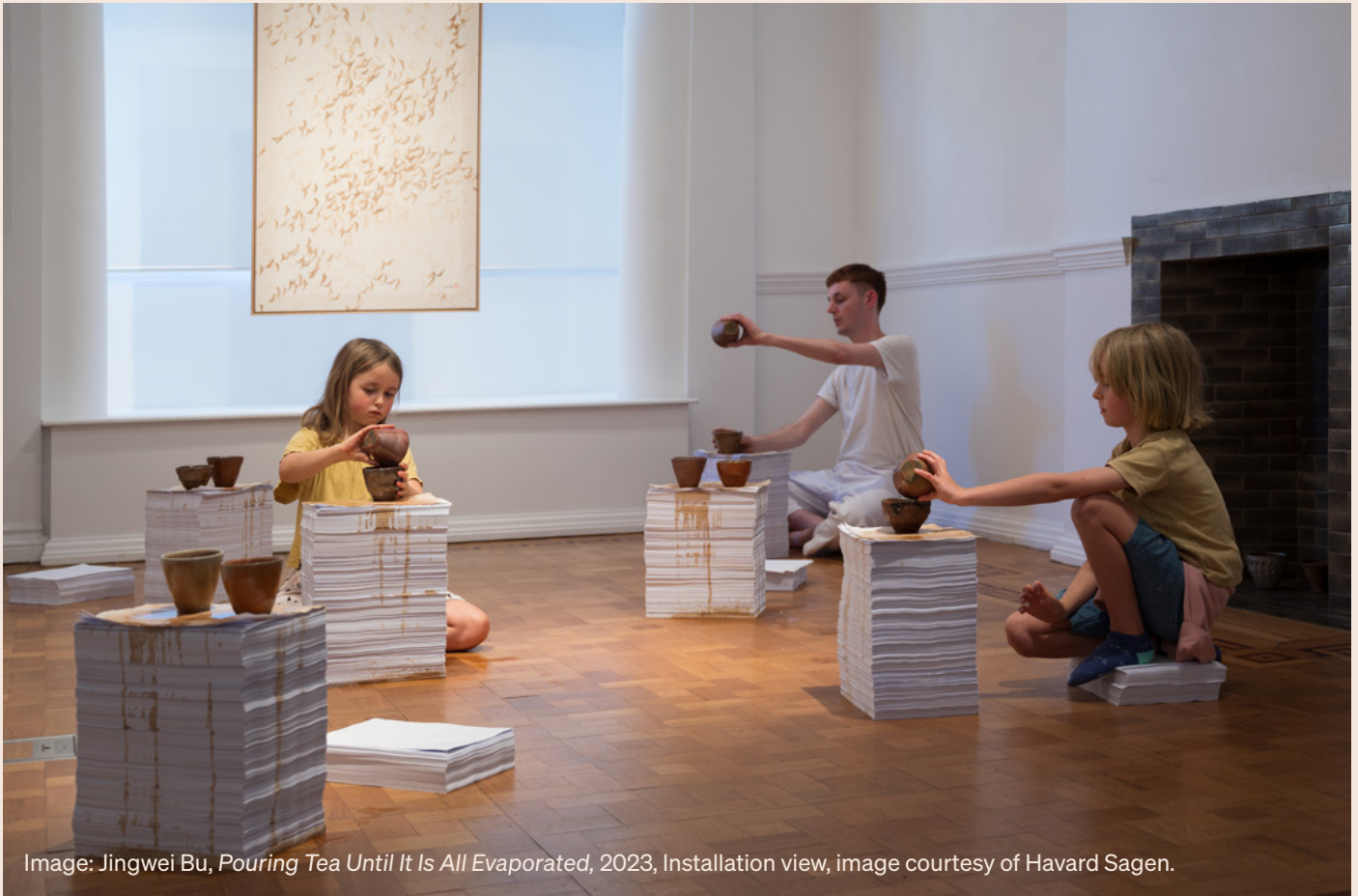
Image: Jingwei Bu, Pouring Tea Until It Is All Evaporated , 2023, Installation view, image courtesy of Havard Sagen.