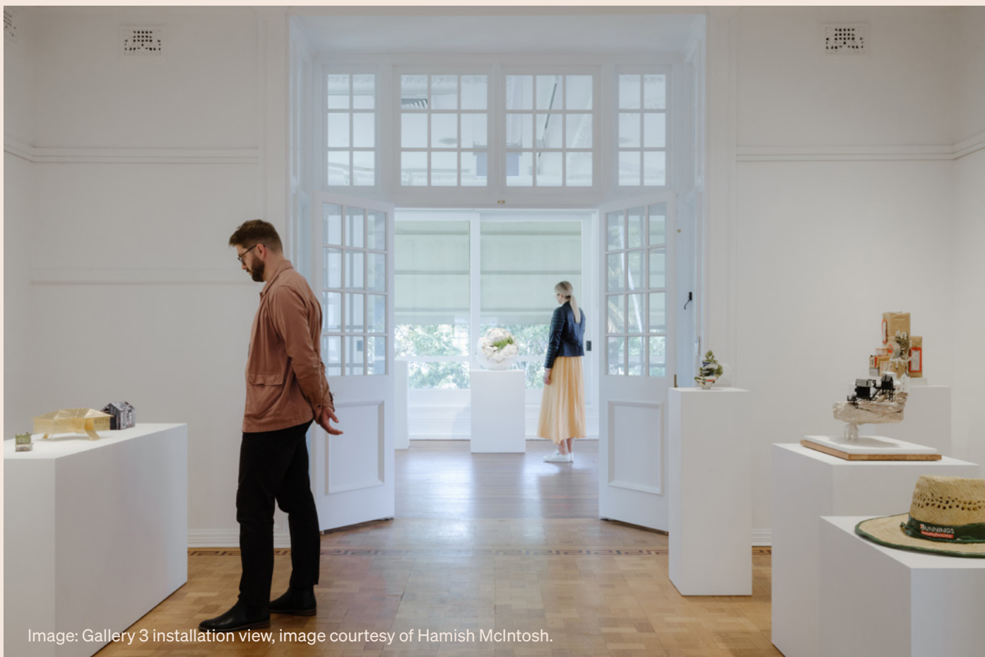
Image: Gallery 3 installation view, image courtesy of Hamish McIntosh.